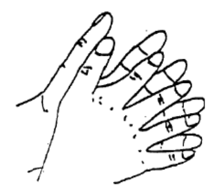
3. Palm to palm fingers interlaced