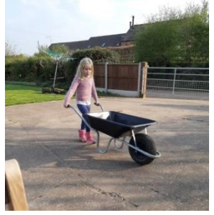
Isabelle (Y2) has been helping out around the garden. Here she is with her wheelbarrow! Well done Isabelle.