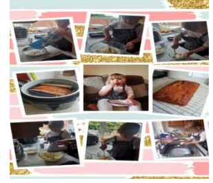
Imogen (N) put her measuring skills to good use this week by making a Banana cake. She even washed up! Great job!